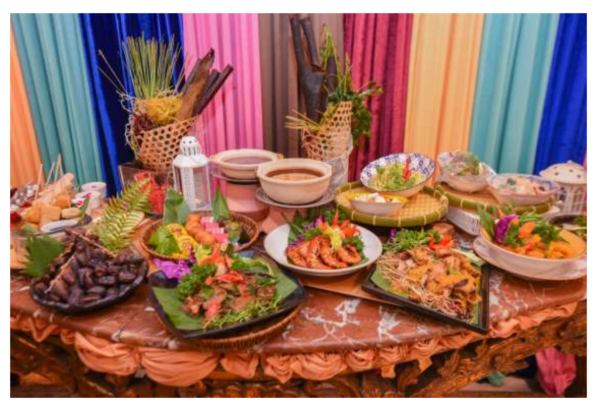
A vibrant spread of local and international cuisine awaits guests at the D'Anjung Buffet at SDCC.

SDCC offers ample free parking and dedicated prayer rooms for guests. Additionally, a ballroom with a stage, projector, and PA system is also available for grander celebrations of 200 guests or more, with packages starting at RM145 nett per person.