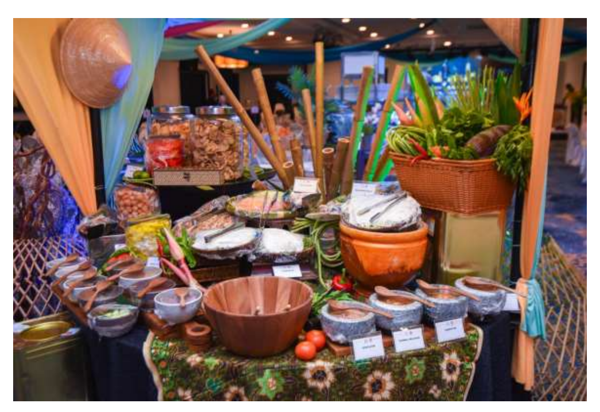
The D'Anjung Buffet features a variety of fresh ingredients with a showcase of timeless favourites.

With its diverse culinary offerings and warm hospitality, the D'Anjung Buffet at SDCC is the perfect way to celebrate the holy month with loved ones.