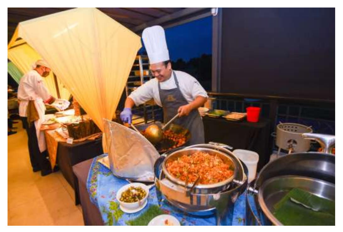
The culinary team at Sime Darby Convention Centre ("SDCC") prepares a variety of dishes for the Ramadan D'Anjung Buffet, offering guests a delightful mix of traditional and modern flavours.

Sime Darby Property's Sime Darby Convention Centre ("SDCC") welcomes Ramadan with the D'Anjung Buffet , available from 4 to 27 March 2025. Featuring a spread of Malaysian favourites and international dishes, the buffet is priced at RM145 nett per adult and RM75 nett per child. Combining the rich flavours of Malaysia with a curated selection of global cuisines, this buffet is ideal for families, corporate gatherings and friends looking to enjoy a hearty, flavourful meal for berbuka puasa .