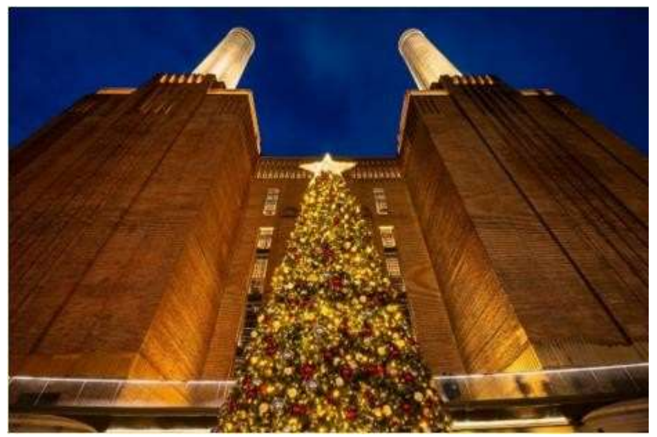
Caption: Be transported to the most magical destination in London at Battersea Power Station this Christmas.