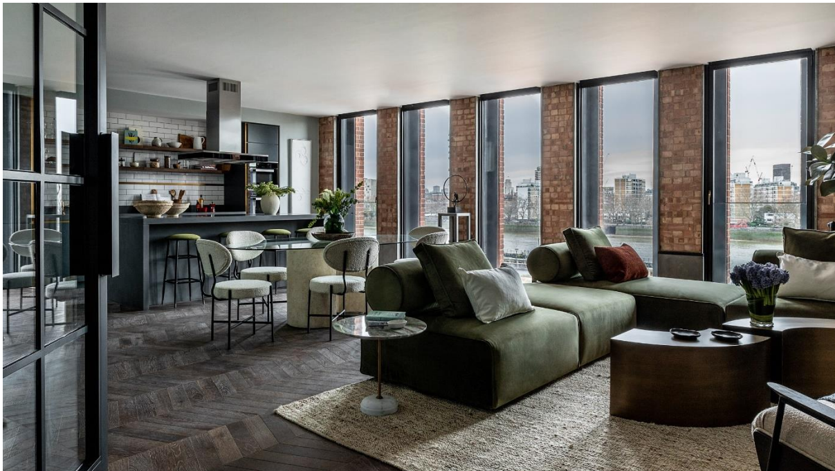
Caption: Switch House East, the second residential element of Battersea Power Station, is now complete and welcoming residents