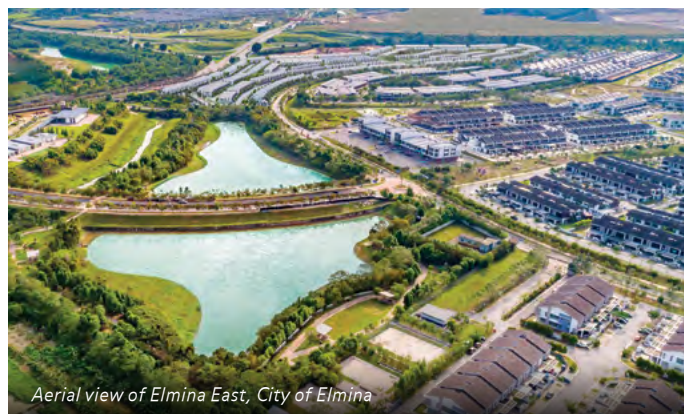
Aerial view of Elmina East, City of Elmina

Based on the Government's projection, the prospects for the economy appear to be robust in 2022, with the GDP expected to grow between 5.5 and 6.5 percent.