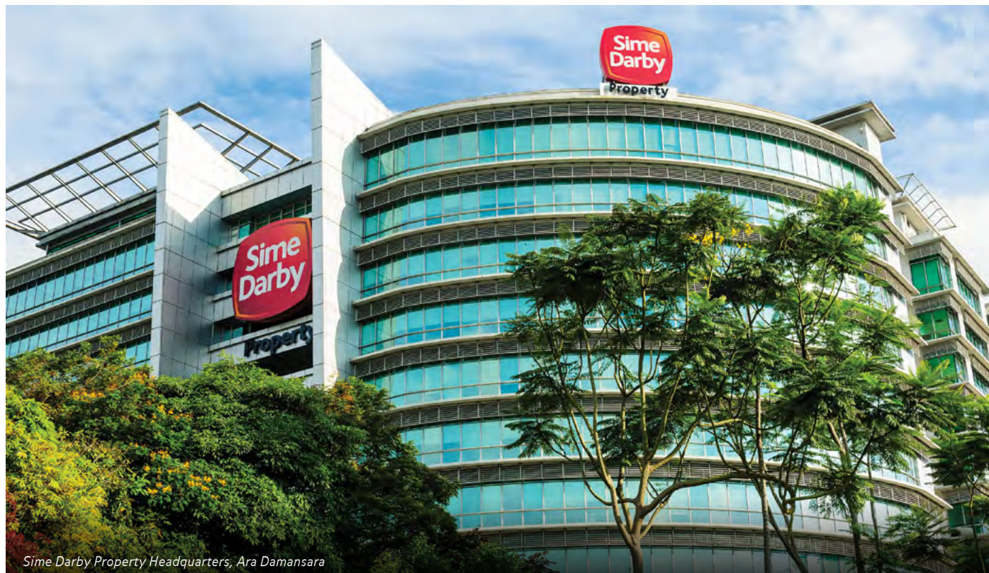
Sime Darby Property Headquarters, Ara Damansara