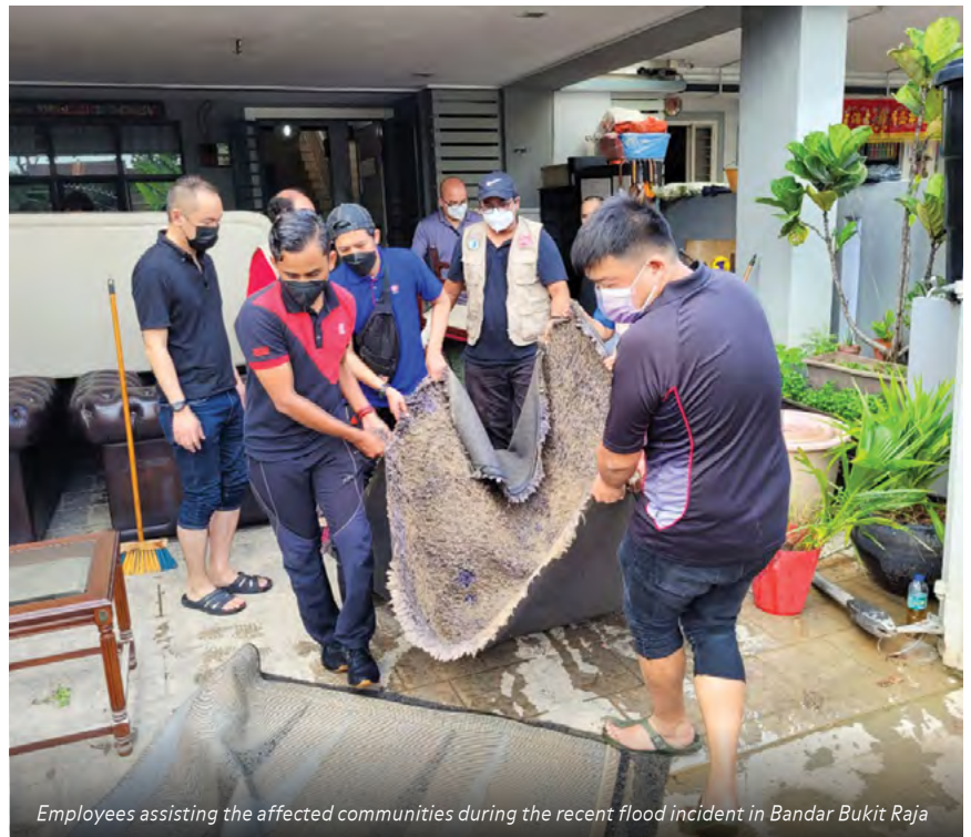
Employees assisting the affected communities during the recent flood incident in Bandar Bukit Raja

●● The Group spent a total of RM96,000 to support 66 employees as at 17 February 2022